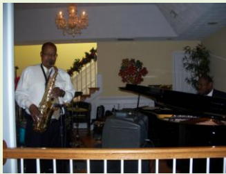
2011 Employee Christmas Social