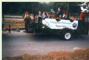
2011 Christmas Parade